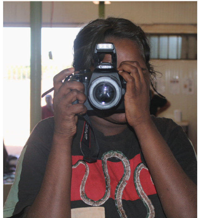
Photo shoot at the Pound

A group of young women took to the camera naturally. Manual functions of the camera were explored and the young women built capacity and confidence both behind and in front of the camera lens.