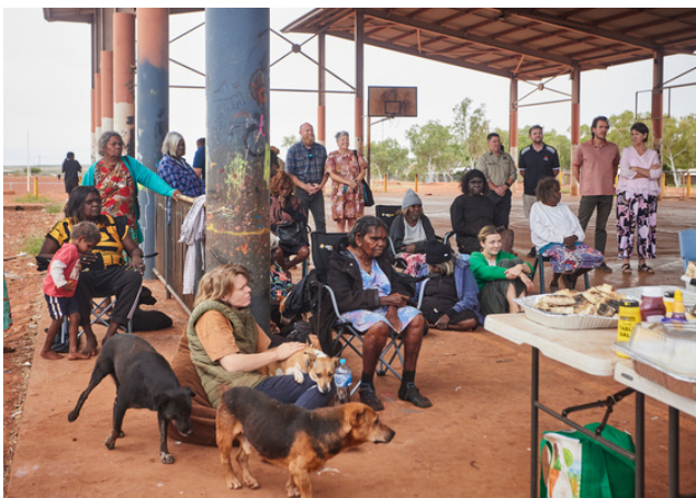
Community members at the event

EPWA and Camera Story are supporting the Piriwa leadership team to manage the Piriwa hub via creating partnerships to access the resources and run skills based workshops. The women are seeking funding to secure a car for Piriwa so they can collect the mail, host more bush trips with young women. The profits from the Piriwa op shop are used for fuel and food for bush trips.