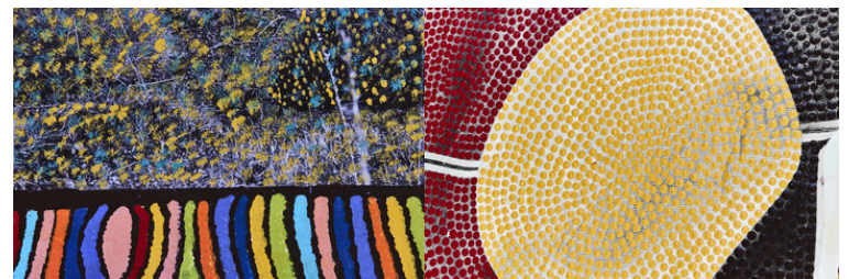
A selection of the postcard designs