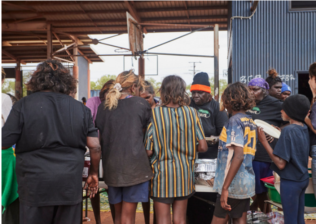
The Piriwa leadership team serving lunch

After the launch party, the ladies decided to open the op shop and pull out all the new donations. Everyone was very happy to explore the new stock.